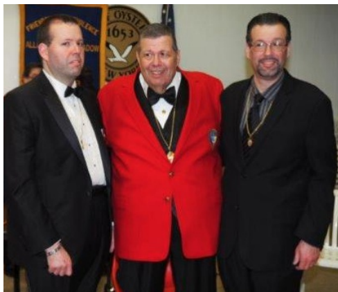
Above past and current Grand Chancellor with their Red Collars (March 16). Right The Blue Jacket (March 21). Left The Red Jacket flanked by current and Past CDGC (all Kohns).