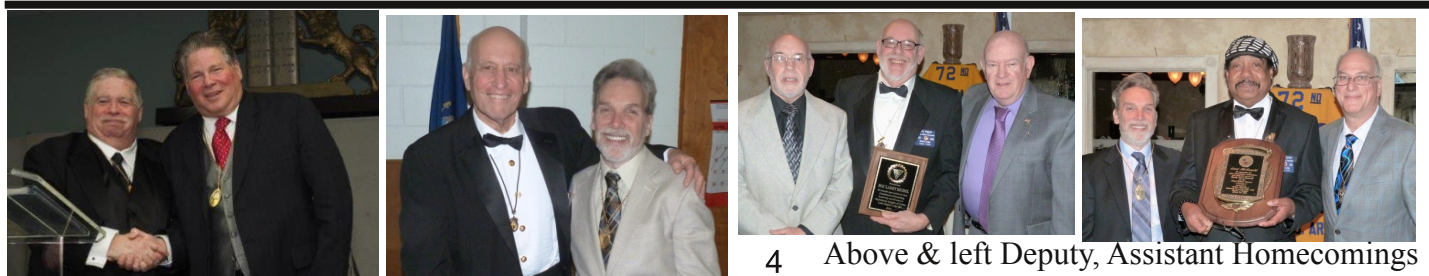
4 Above & left Deputy, Assistant Homecomings