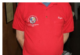
7 Polo Shirt