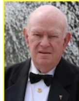
Grand Prelate Sir Charles Pakula