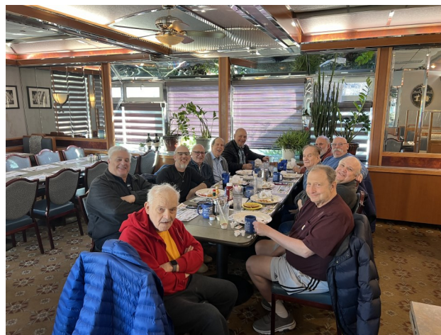
Photo from last month's Freeman's Breakfast

If you like, bring a friend. A prospective member.