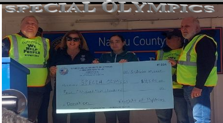
The Knights of Pythias raised $4,500 and were the Golf Scorers for the Special Olympians. Thank you to the scorers and donors. Your support helps.

CRIERS LODGE INSTALLATION OF OFFICERS DINNER WILL BE FRIDAY JUNE 5, 2025