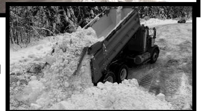
OTHER BLIZZARD CLEAN UPS ➔➔