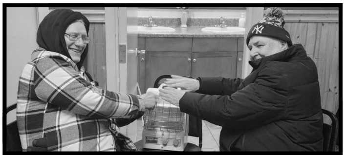
Active members attempting to keep warm.