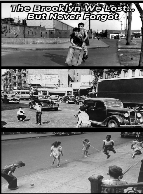
The Brooklyn We Lost... But Never Forgot