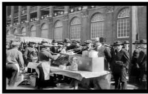
↗↗ THE SCENE OUTSIDE THE POLO GROUNDS 1960'S SHEA STADIUM ↗↗