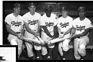
↗↗ 1953 DODGER GREATS CENTERFIELD @ EBBETS FIELD ↗↗