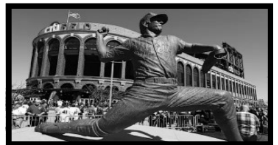
AN ODE TO TOM TERRIFIC