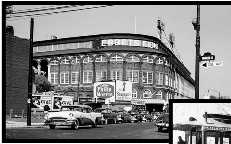
↗↗ EBBETS FIELD 1953 THE TROLLEY THAT TOOK YOU TO THE POLO GROUNDS IN EARLY 1900'S ↗