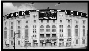
1960'S YANKEE STADIUM