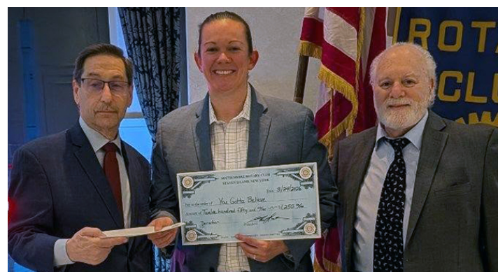
Presentation of check to the Brooklyn Youth Music Project