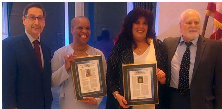
Healthcare Heroes receive their awards